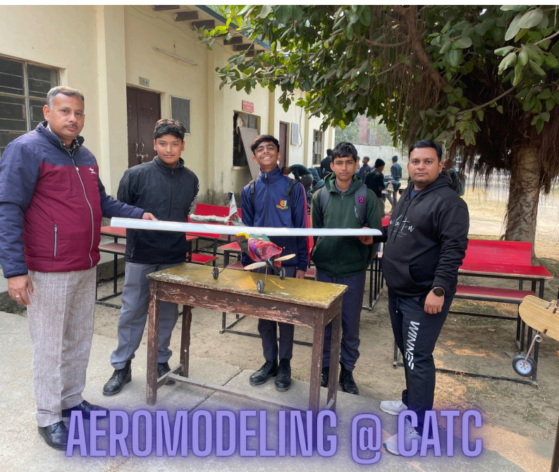
AEROMODELING @ CATC