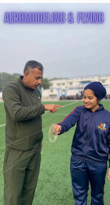
AEROMODELING & FLYING