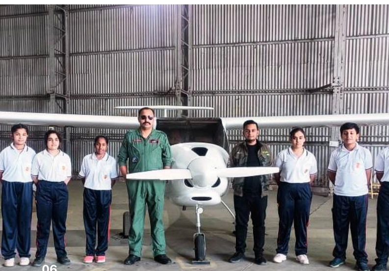
06 CADETS WITH WING COMMANDER BEFORE FLYING